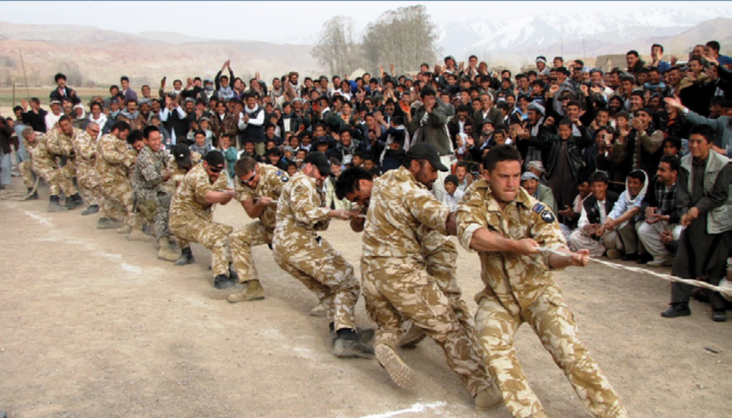
In 2010, the New Zealand Provincial Reconstruction Team participates in a tug-a-war challenge between teams from the various villages around Bamyān Province in Afghanistan.