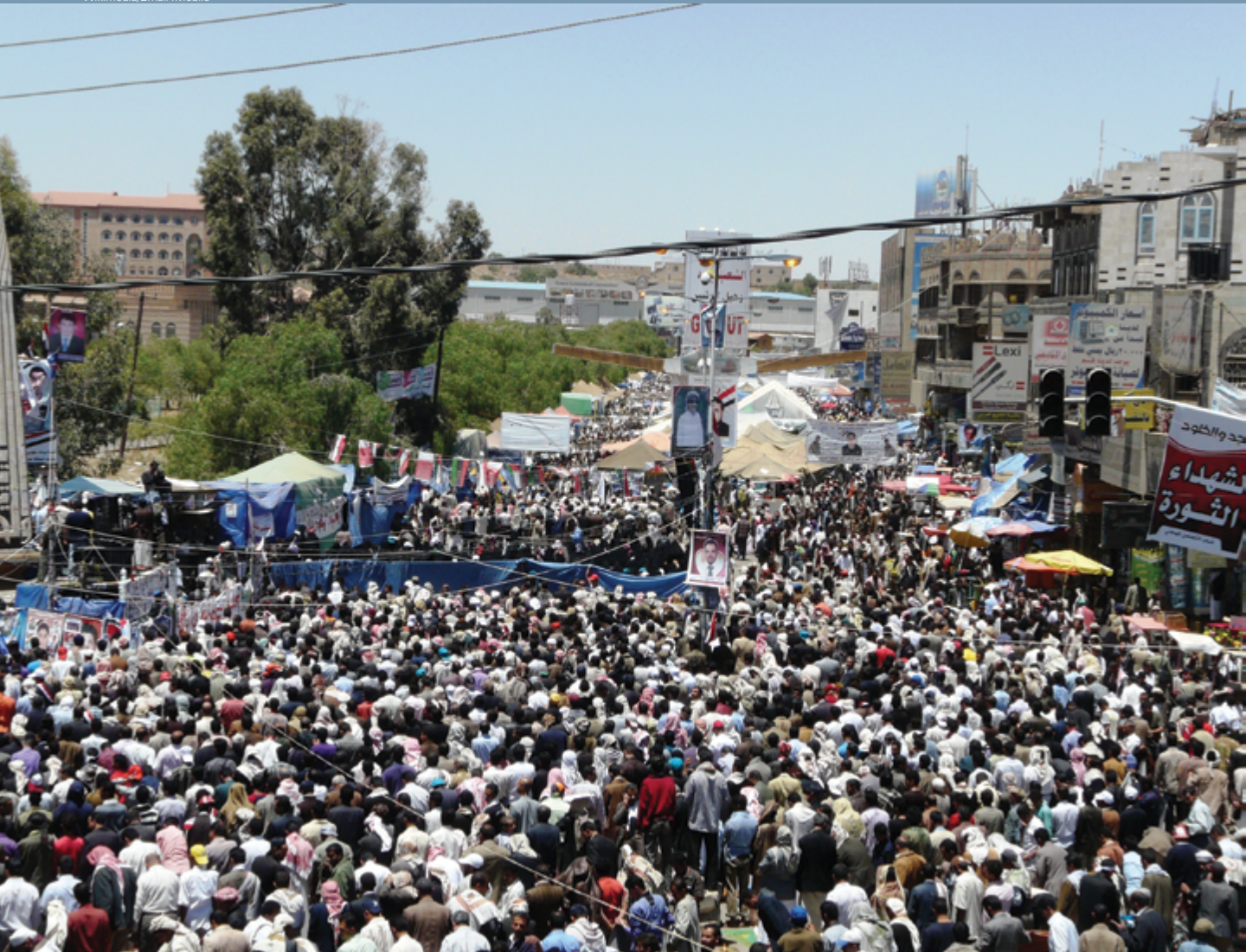
Protests in Sanaa, Yemen in April 2011.