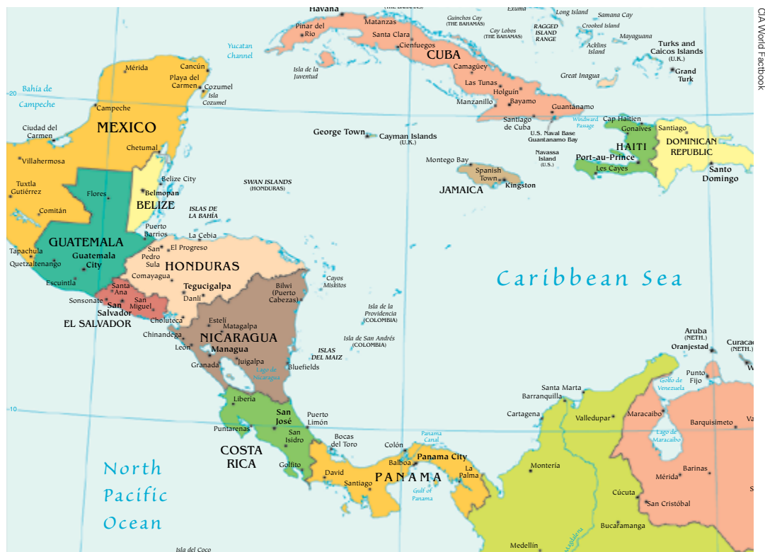
Map of Central America