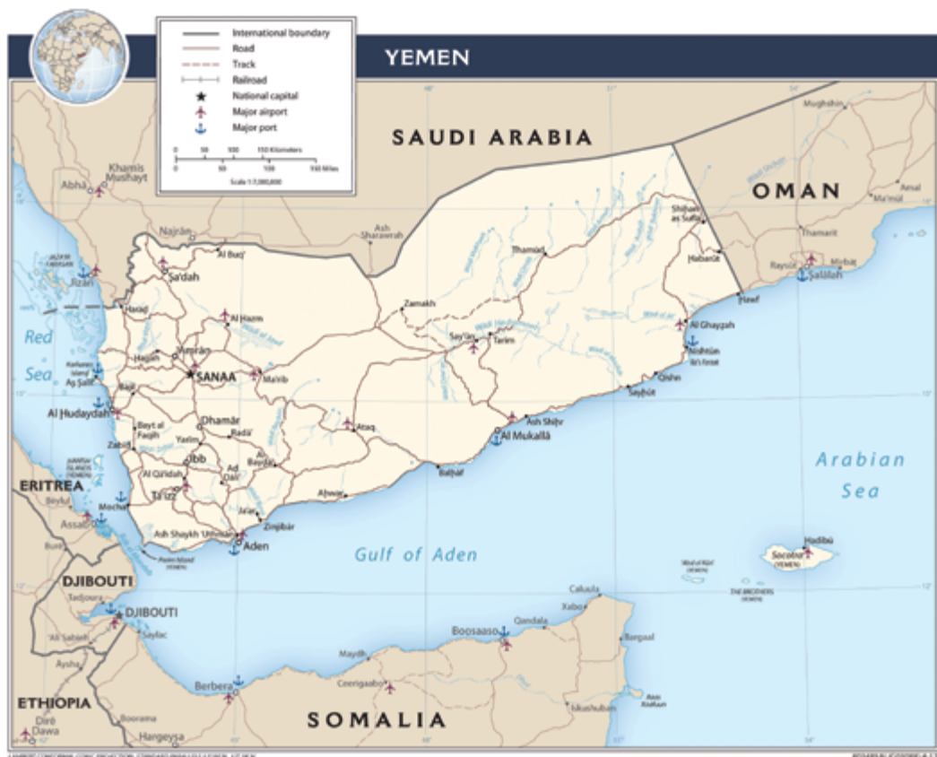
Yemen transportation map from 2012.

Rough estimates of civilian casualties since fighting began in March 2015 now exceed 10,000 killed with more than 40,000 injured, according to press reports, and the human toll continues to mount. The UN Office of