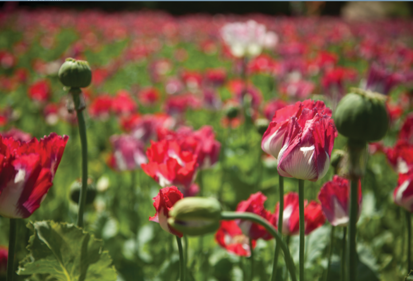
A poppy field in Helmand Province in Afghanistan in April 2013.