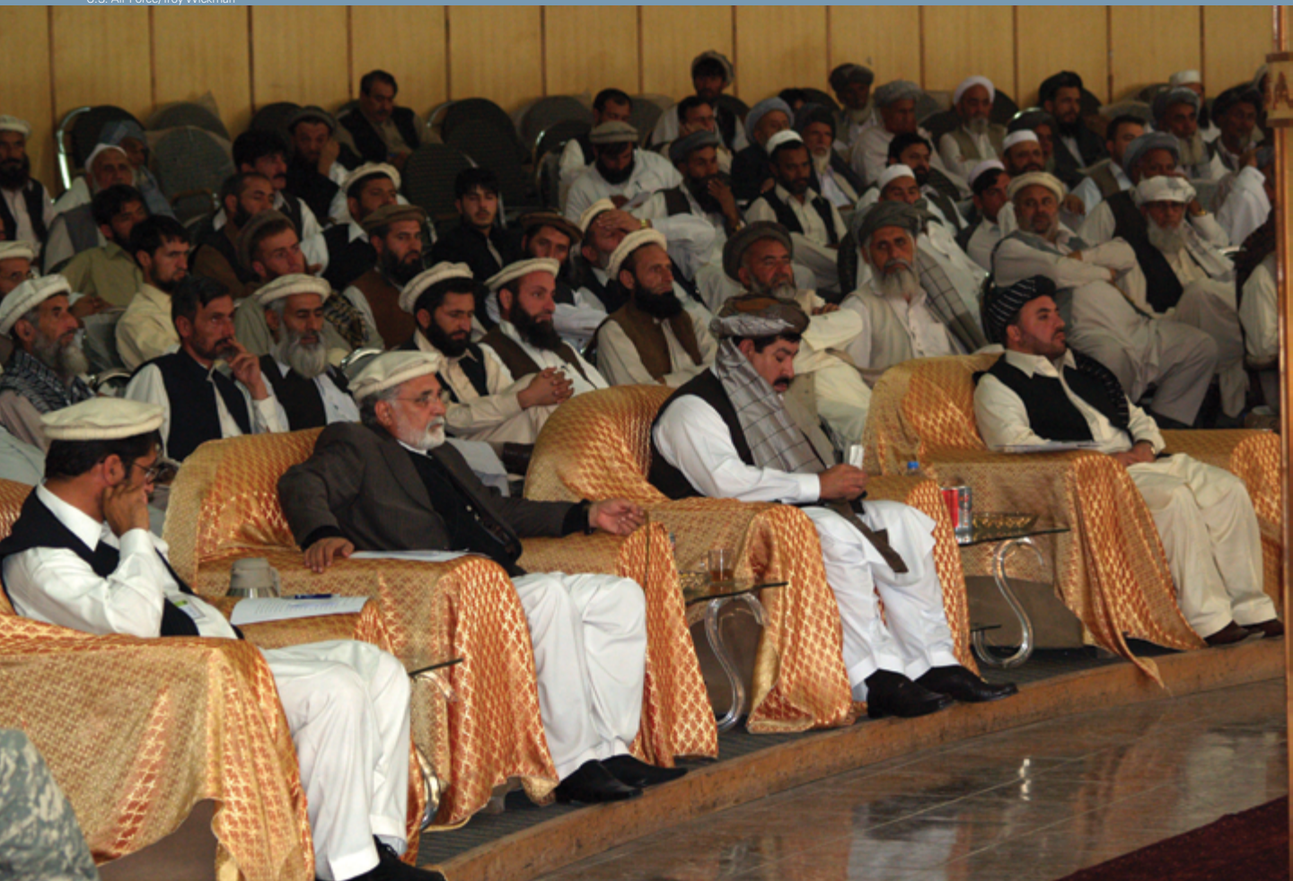
In October 2009, provincial governors gather to lay out their homegrown plan to improve the security and development of the four easternmost Afghanistan provinces.