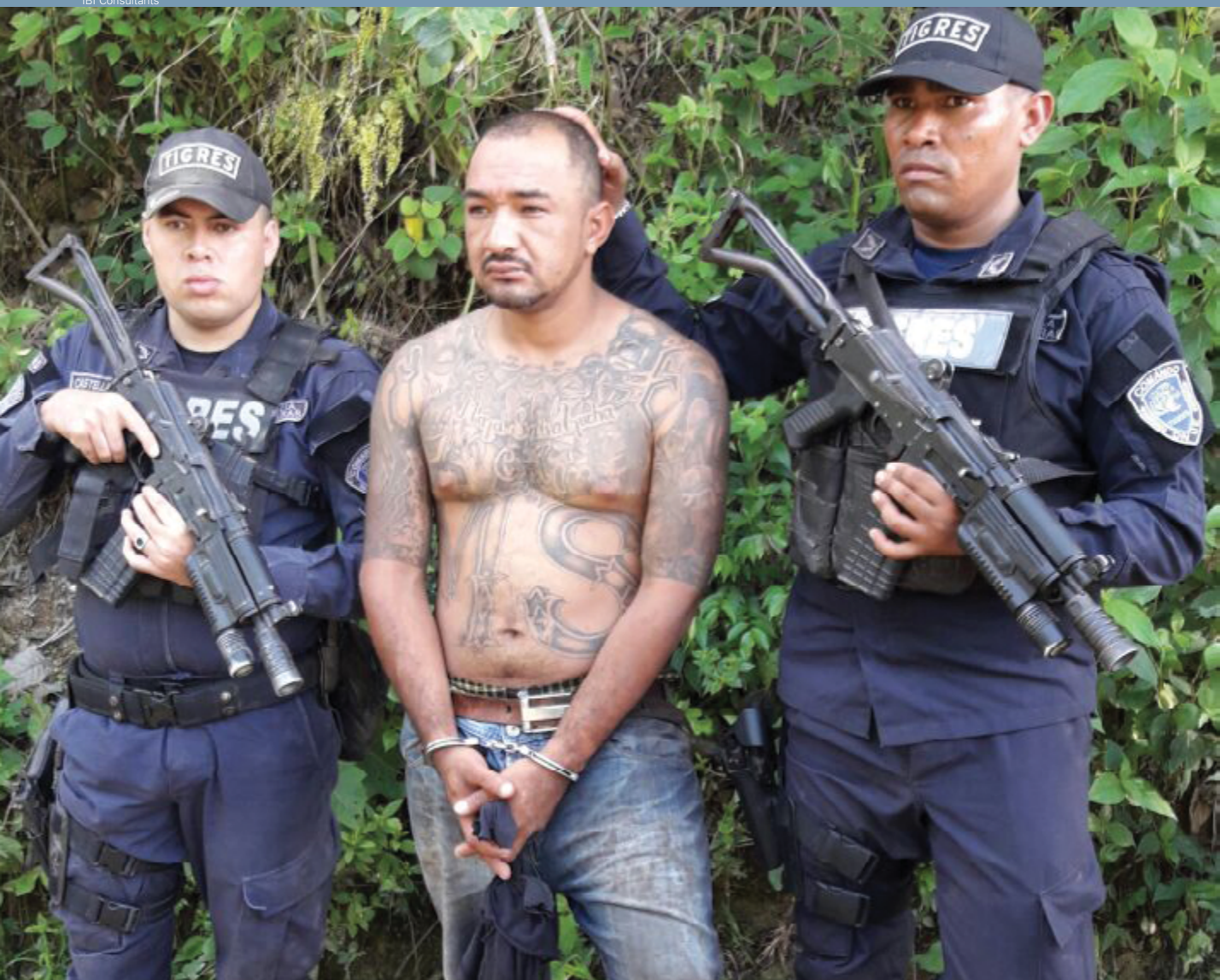
Honduran police in May arrest a MS 13 member accused of leading groups in the rural areas outside of San Pedro Sula, where the gang presence has been expanding to control drug trafficking routes.