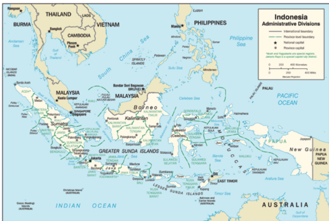
Map of Indonesia and neighboring Malaysia, with portions of the Philippines depicted.

The extent of the ISIL presence in the Philippines remains disputed among academics, independent researchers, and Philippine Government authorities, particularly the military. However, evidence of ISIL infiltration in Mindanao exists and, as of October 2014, a Philippine Army brigade, an estimated 1,500 soldiers, increased support for intelligence collection in Mindanao, the second largest island in the Philippines. 36