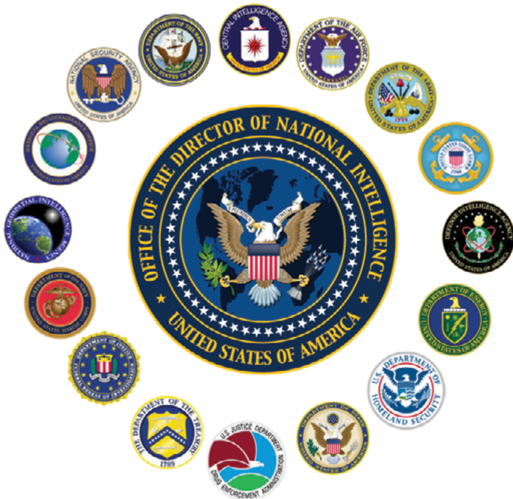
The 17 elements of the U.S. Intelligence Community. Use of this graphic does not reflect an official endorsement by the IC.

neglect. The U.S. Office of Personnel Management made a laudable but belated attempt to reinvigorate the program in July of 2016, issuing guidance that encouraged agencies to identify those senior civilian positions in the NSE that require interagency experience as a technical qualification requirement (although not necessarily a leadership one); and it urged the use of temporary and permanent career-broadening assignments, as well as existing inter-agency