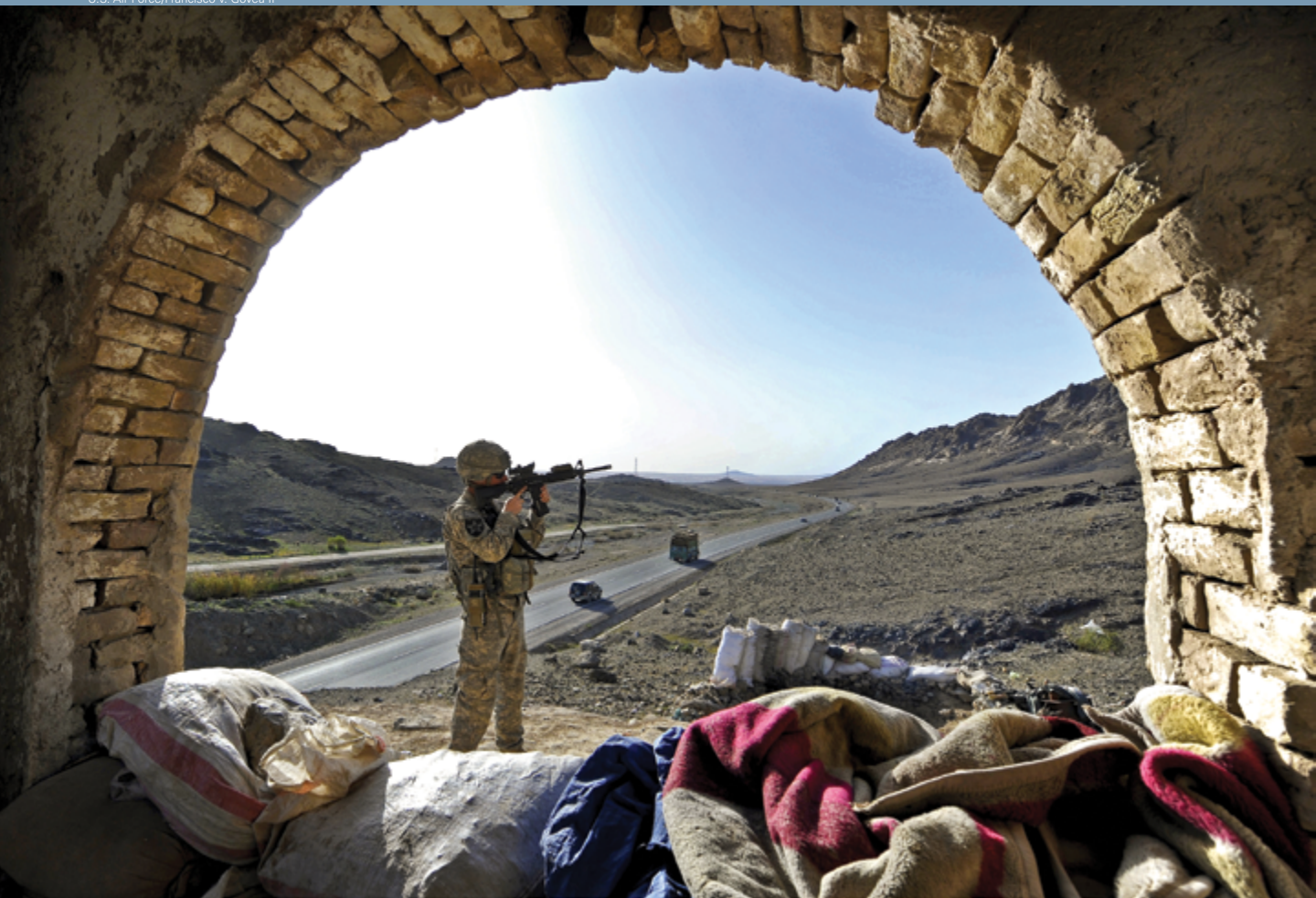
In 2010, a soldier provides security outside an Afghan Police checkpoint in Taktehpul, Afghanistan.